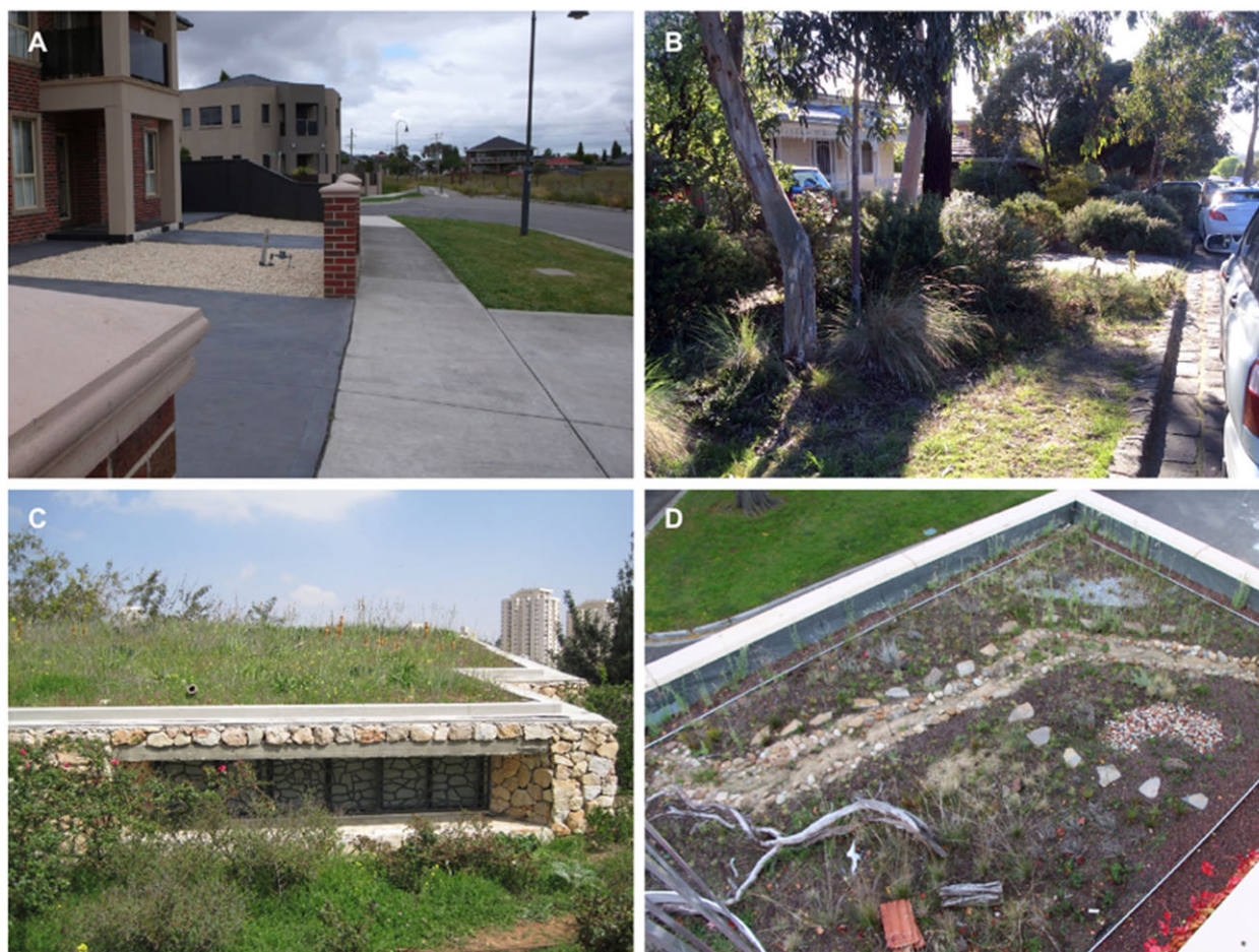
Figure 1 The biodiversity impacts of urbanization can be mitigated by sensitive urban design. (A): Residential development across the road from a protected native grassland remnant in northern Melbourne, Australia. This residential property is devoid of vegetation (save for the lawn on the nature strip), providing little habitat or resources for native species that live in the grassland across the road. Compare this to image (B) (also in Melbourne), where the nature strip has been planted with a variety of native species, including trees, shrubs and grasses. The structural diversity creates a mosaic of habitat for a range of species. (C): The roof and walls of the Jerusalem Bird Observatory have been designed to provide habitat for birds and bats. (D): The biodiverse roof at The University of Melbourne provides a diverse range of habitats, including hollow logs, grassland, and an ephemeral stream. Photo credits. A, B: Georgia Garrard; C: Architecture–WEINSTEIN VAADIA ARCHITECTS, Photography–Amir Balaban; D: Nick Williams.

focused design protocols. In the absence of a practical framework for incorporating existing urban ecological knowledge into urban design and development, planners and developers have little guidance about which design elements to implement, or how to balance biodiversity with other objectives. There is now an urgent need for an evidential urban design protocol that links urban design to biodiversity outcomes.