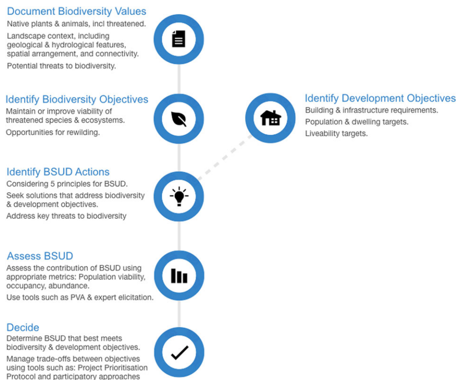
Figure 2 A framework for implementing biodiversity sensitive urban design.